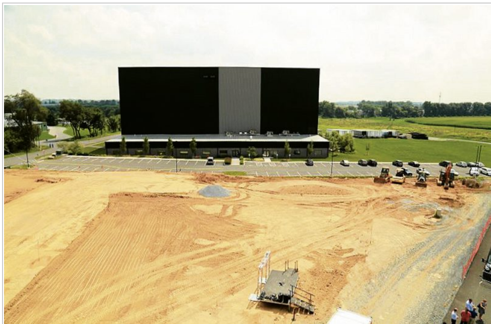
The Rock Lititz Studio will be prominent in the southward view from the hotel penthouse.

It’s much more sophisticated than that, he explained.