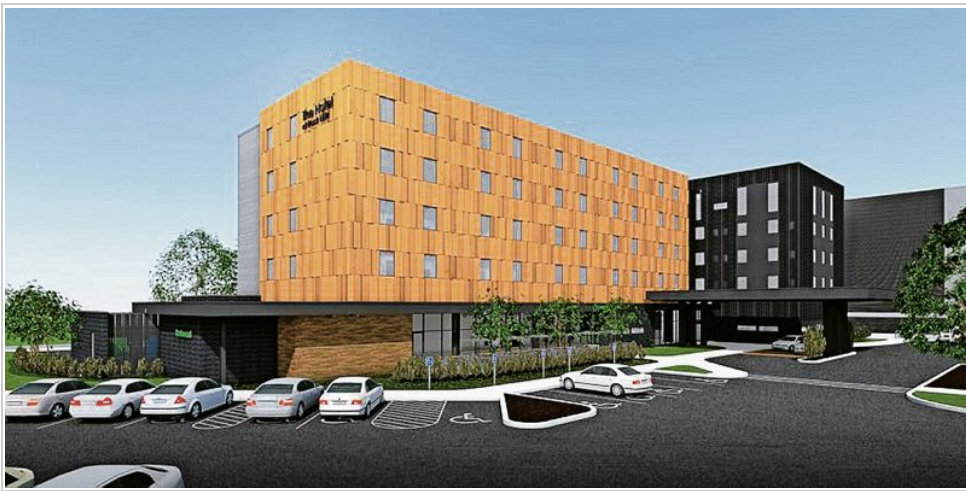
A rendering of what the hotel will look like when it's complete in the fall of 2018.

Rock Lititz is known for putting on a show, so it was no surprise that the official groundbreaking for the new Hotel at Rock Lititz had plenty of flair.